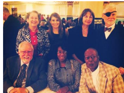
Saving Our Youth's first Board of Directors